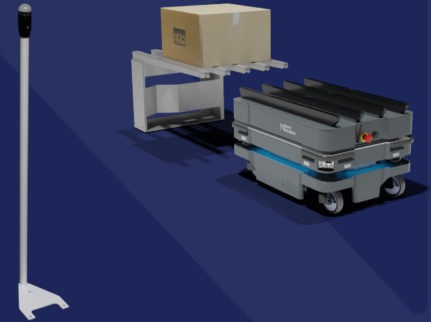
Stack light tower